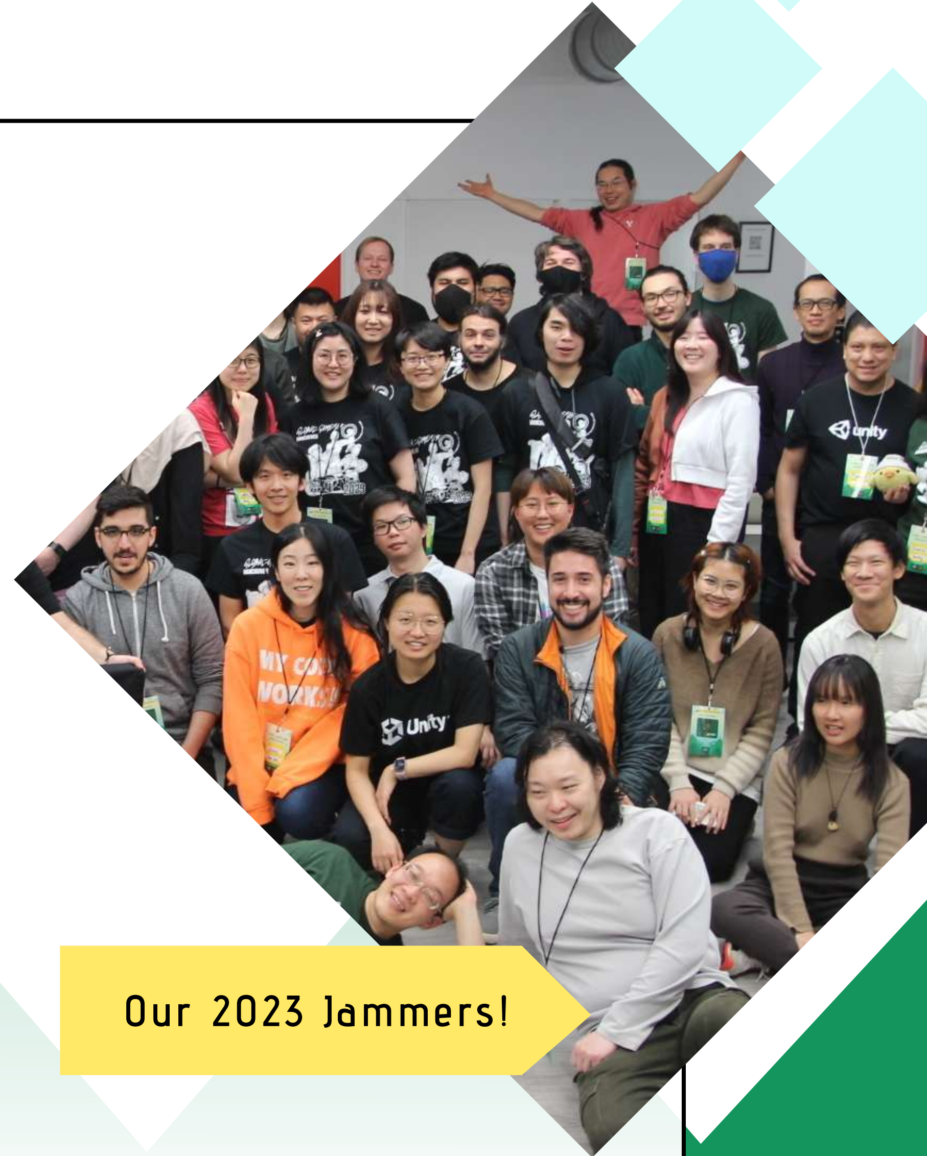
Our 2023 Jammers!

The jam will take place from January 26-28, 2024. Over those 3 days, participants will design, develop, and create unique games in parallel with jammers from every part of the globe.